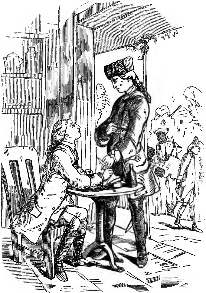
George's Secretary at War.